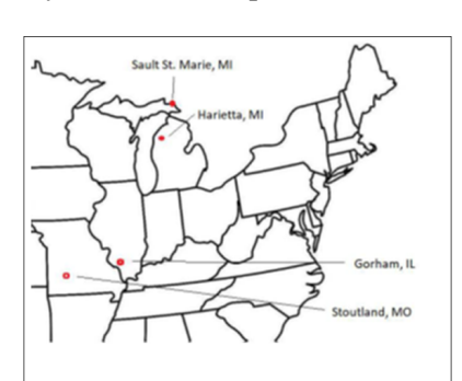
Figure 1. Locations of the proposed evaluation in the NCR

In this project, farms were selected that provided a wide diversity of species and a wide geographic range within the region. Figure 1 depicts the location of the four participating farms. Michigan Wholesale Walleye, Sault St. Marie, MI, produces primarily walleye ( Sander vitreus ) during the warmer months of the year in outdoor ponds. However, their ponds are not classic aquaculture ponds. Their ponds have