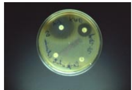
Figure 1. A sensitivity test shows the resistance of the disease-causing bacteria to various antibiotics.

To optimize the response to antibiotics provided in feed, producers should correct other problems which may have predisposed fish to the bacterial infection. This should include checking water quality parameters and submitting proper fish and water samples to a diagnostic laboratory. If the fish have a bacterial disease and the causative agent has been identified, a sensitivity test should be performed to ensure that the correct medication is used. A sensitivity test (Figure 1) shows the resistance of the disease-causing bacteria to various antibiotics. If bacteria are unable to grow in the presence of a particular antibiotic, a zone of inhibition or clear area is present surrounding the area treated with that drug. If the drug has no effect on the bacteria, they will grow up to or over the top of the disc.