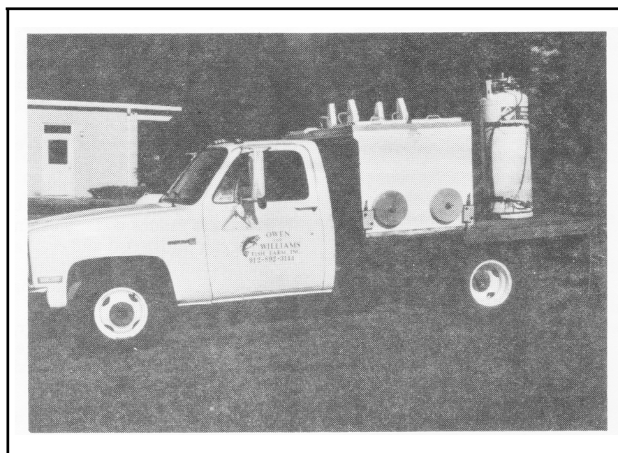
Custom designed transport truck using liquid oxygen for aeration. Note size of discharge opening for large fish and side location of drain.

Pond water is less desirable because it often has a heavy algae bloom and other organisms that remove oxygen from the water and produce ammonia as a waste product. Pond water also is more likely to have harmful fish pathogens than well or spring water. Clear pond water without a heavy algae bloom can be used for short trips. Special care is