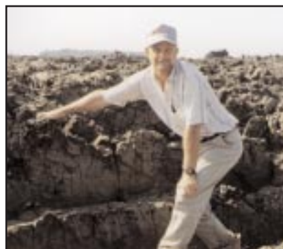
Figure 5. Rows of pond bottom sediments are usually 4 to 5 feet high.

The sediment should be soft enough to still flow slightly. If allowed to dry too much, the mud pushes down the pond rather than flowing to the sides. The goal is to row up the mud (pile the bottom sediments in rows) down the pond length for good drainage and quick drying. You may need to make more than one pass, several days apart, to complete this stage of the process. The rows will be 4 to 5 feet high and of equal width, with the parent soil showing slightly between the rows (Fig. 5). Rains will drain off the rows and flow down the channels left by the bulldozer.