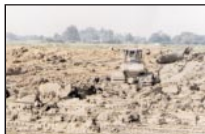
Figure 6. After material in the rows has dried to a heavy plastic consistency, pack the soil back against the levees.

Allow the rows to dry for 2 to 3 weeks, depending on rainfall, or until the rows are a heavy plastic consistency. Then, bulldoze across the rows starting at the pond center, moving toward the nearer levee. The push should pack the entire distance to the levee (Fig. 6). When all the sediment has been packed back into the levee slopes, top a small amount of the original clay from the pond bottom back over the packed sediment material. This minimizes erosion during the early period when the pond is refilled.