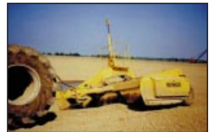
Figure 2. A small dirt pan (dirt bucket) is used for finishing work in rebuilding levees.

Alternatively, after the pond bottom dries enough to support a wide-track dozer, use the dozer to push moist pond bottom soil to the levees. The dozer rolls up on the levee to pack the material back in place. Then use tractor-drawn dirt pans (Fig. 2) to finish the pond to grade, leaving a smooth surface that slopes to the drain. Bulldozers and dirt pans can be used to rebuild ponds as small as 1 / 4 acre. Laser sights on the equipment help the operator maintain the appropriate pond bottom slope.