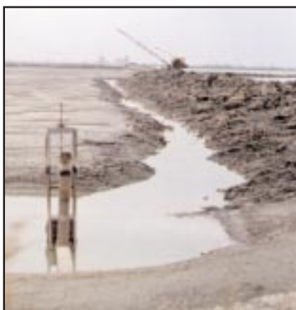
Figure 3. The first step in the Mississippi method of rebuilding ponds uses a dragline to dig a drainage ditch around the levee.

A new technique of some Mississippi Delta farmers uses a dragline and bulldozer only. This method is usually reserved for ponds with deep sediments (more than 2 feet deep) in ponds not drained in 10 to 15 years. The Mississippi method involves draining the pond as usual for a complete reconstruction. After all the water is gone, the dragline digs a 3- to 4-foot-deep drainout ditch along the levee base around the entire pond, which allows water to weep from the pond sediments and leave at the drain (Fig. 3).