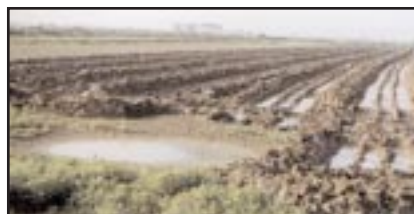
Figure 4. After pond bottom sediments become firm enough to flow, use a dozer to row up the material.

ramp to allow a size 65D bulldozer to cross into the soft sediments. The bulldozer makes passes down the pond length, rowing up the soft sediment on either side of the blade on each pass (Fig. 4).