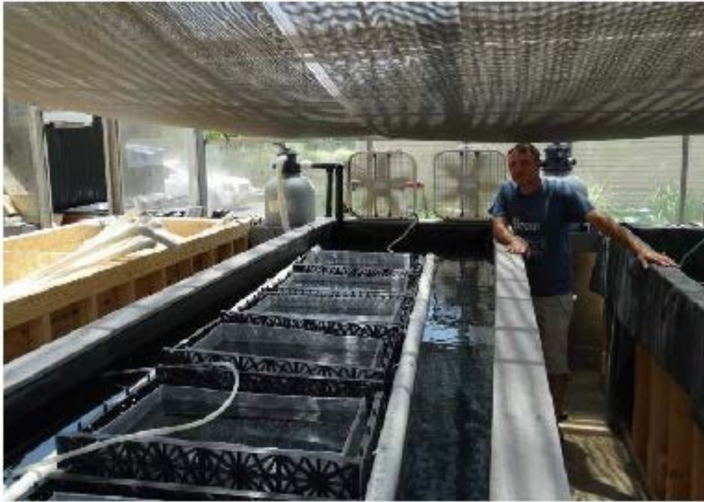
Figure 1 Floating net cages system (Melman, T., Reef System Coral Farm, Inc., New Albany, Ohio)

Table 1. Mean \pm standard deviation of weight (mg), total length (mm), and survival (%) of fish from each diet treatment after 14 days of feeding. Weight and total length of fish across all diets before the start of the feeding experiment was 5.4 \pm 3.0 mg and 9.9 \pm 1.56 mm, respectively.