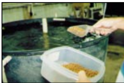
Hybrid striped bass efficiently digest soluble carbohydrate in practical diets.

Another study was conducted at Texas A&M University to determine the protein digestibility of several feed ingredients for sunshine bass. These ingredients included low-temperature-processed menhaden meal, regular menhaden fish meal, anchovy meal, meat-and-bone meal, poultry by-product meal, soybean meal, and cottonseed meal. Low-temperature-processed menhaden fish meal had the highest protein digestibility coefficient. Meat-and-bone meal and poultry by-product meal had lower protein digestibilities than any of the ingredients of fish or plant origin. Higher protein digestibility values were recorded for anchovy