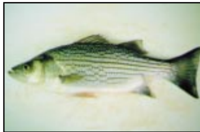
Hybrid striped bass have considerable aquaculture potential.

Protein is an essential nutrient that must be included in the diet at appropriate levels to ensure adequate growth and health of fish. However, because protein is the most expensive component of most aquaculture diets, supplying protein in excess is not economical. Similarly, it is important to maintain a proper ratio of protein to energy in the diet. Adequate energy must be supplied so that